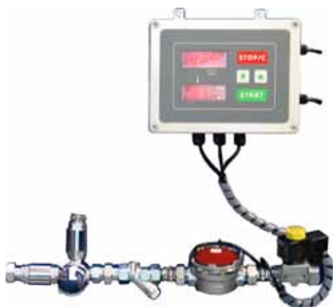
Dox 25 M